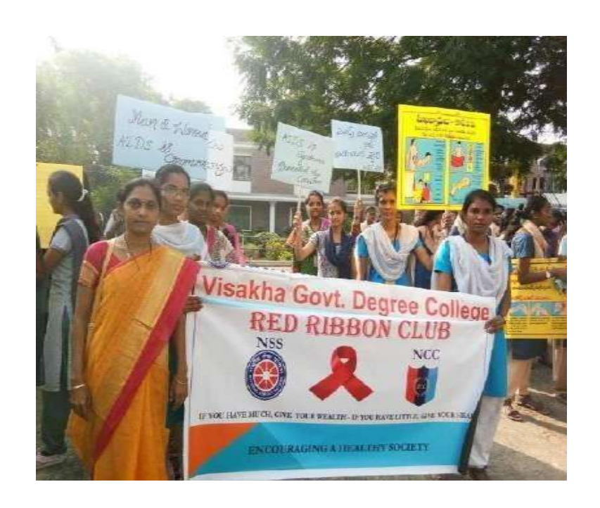
World Aids Day Rally

National Service Scheme in collaboration with Red Ribbon Club Andhra University.